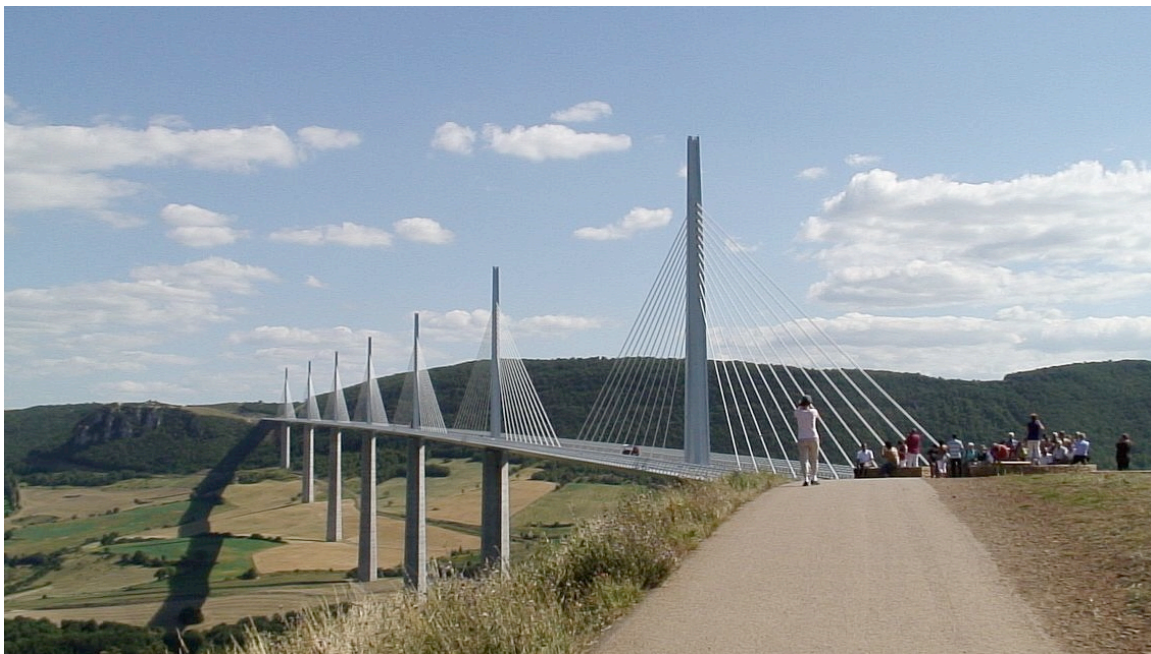
The spectacular Millau Viaduct

Day 12 - Monday, May 21: After a leisurely breakfast, we head for nearby (25km) Conques , arguably the prettiest of all towns and villages along the roads to Santiago de Compostela in France! The major attraction here is the magnificent Romanesque Abbey Church of Ste. Foy, featuring fine sculptures, a cloister, and a sumptuous collection of relics and other treasures, most famously the 10 th -century statue-reliquary of the