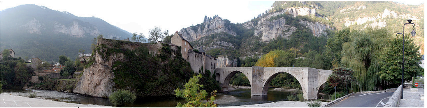
The village of Ste Énimie in the Gorges du Tarn

Pauwels Travel Bureau Ltd. 95 Dalhousie Street, Brantford, Ontario N3T 2J1, Canada Tel: 519-756-4900 / 519-753-2695 - Fax: 519-753-6376 tours@pauwelstravel.com – www.pauwelstravel.com