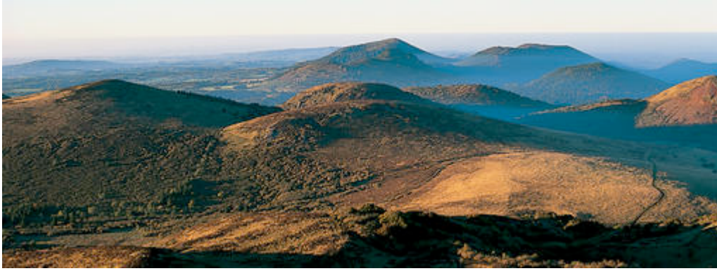
Extinct volcanoes as seen from the Puy de Dôme (anonymous photo c/o Wikimedia Commons)

Day 7 - Wednesday, May 16: Today we visit two of France's finest examples of Romanesque art and architecture, the Basilica of St. Julien in Brioude and the Abbey Church of St. Robert in the village of Chaise-Dieu . Then we continue via the fortress of Polignac to Le Puy-en-Velay , a beautiful old town dramatically nestled in the huge crater of an extinct volcano. Le Puy was the starting point of one of the four roads used by pilgrims to cross France on their way to Santiago de Compostela. Accommodation in the centrally-located Hotel Ibis Styles ( http://www.ibis.com/gb/hotel-1197-ibis-styles-le-puy-en-velay/index.shtml ), and this evening's dinner will likely feature a famous local specialty: green lentils ( lentilles du Puy ).