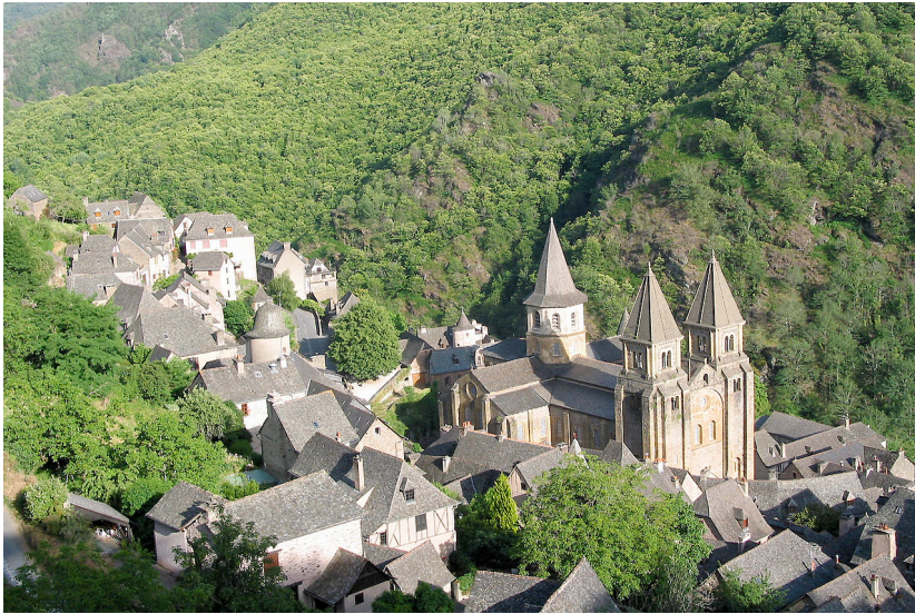
< Conques and its Romanesque abbey church

church's patron, Ste. Foy, herself. After our tour of the town, there will be plenty of time to explore on your own, take pictures, even have lunch. In the afternoon we return to Entraygues, and rest of the day at leisure. No group dinner this evening.