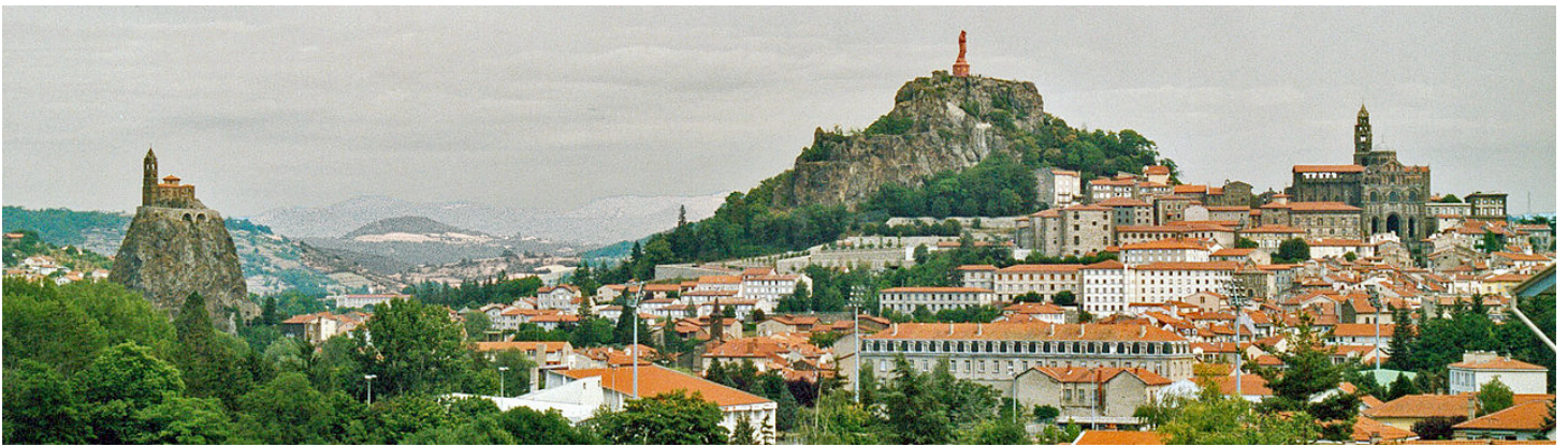
Le Puy en Velay, with St. Michael of the Needle, the huge statue of the Virgin Mary, and the Cathedral

Day 7 - Wednesday, May 16: Today we visit two of France's finest examples of Romanesque art and architecture, the Basilica of St. Julien in Brioude and the Abbey Church of St. Robert in the village of Chaise-Dieu . Then we continue via the fortress of Polignac to Le Puy-en-Velay , a beautiful old town dramatically nestled in the huge crater of an extinct volcano. Le Puy was the starting point of one of the four roads used by pilgrims to cross France on their way to Santiago de Compostela. Accommodation in the centrally-located Hotel Ibis Styles ( http://www.ibis.com/gb/hotel-1197-ibis-styles-le-puy-en-velay/index.shtml ), and this evening's dinner will likely feature a famous local specialty: green lentils ( lentilles du Puy ).